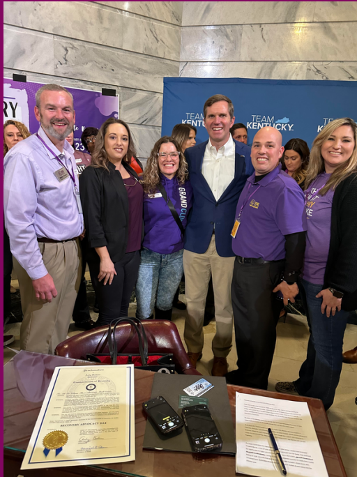
Governor Andy Beshear (3rd from R) with members of YPR's Kentucky chapter team.

Kentucky is in the throes of the nationwide opioid epidemic and ranks second in the U.S. for overdose deaths. According to the 2021 Kentucky Overdose Fatality Report, fentanyl was present in nearly 73% of overdose deaths. Worse yet, many people who overdose on fentanyl don't even know they're taking it. The drug has been added to counterfeit pills and other substances that people believe are safe. Yet fentanyl test strips were illegal in Kentucky because they were considered drug paraphernalia.